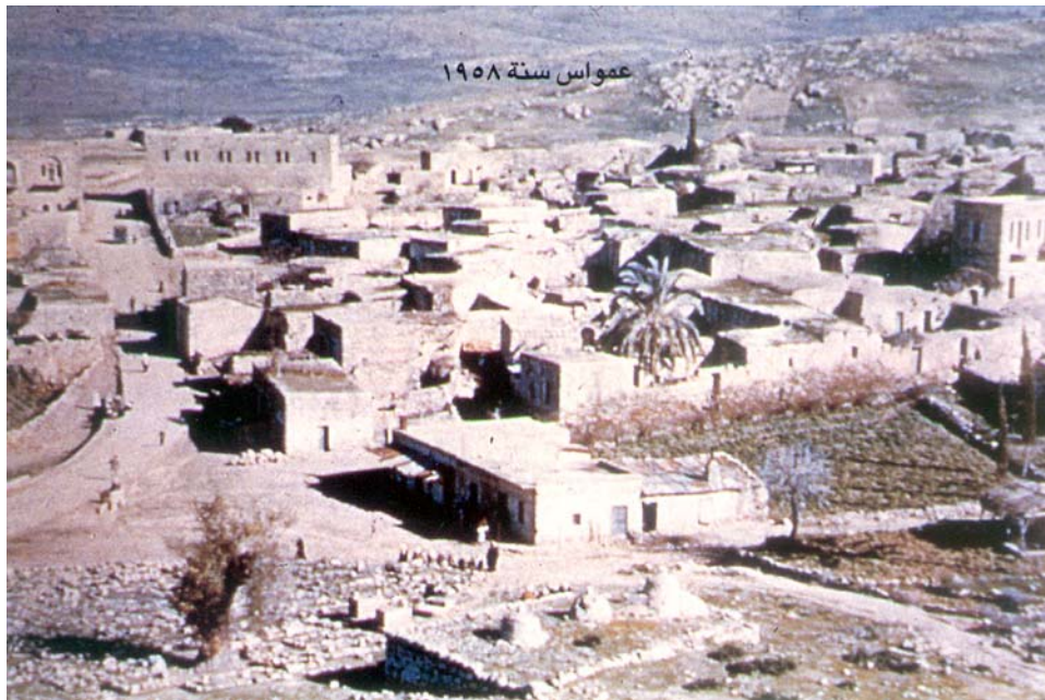
'Imwas 1958